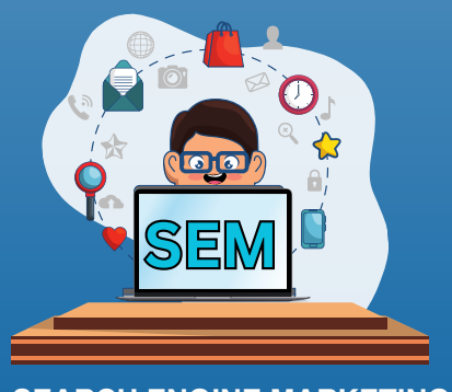
SEARCH ENGINE MARKETING