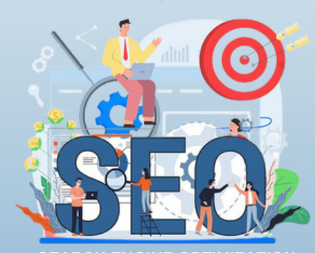
SEARCH ENGINE OPTIMIZATION