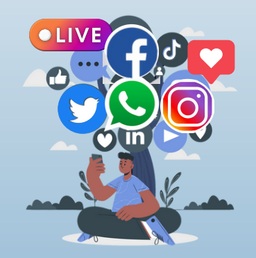
SOCIAL MEDIA MANAGEMENT